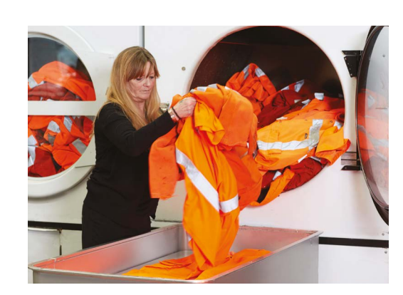
The wash process is designed to be tough on oil and grease, yet kind enough to prevent fading and garment damage.

Following segregation, each garment is laundered and dried at a low temperature to protect the fabric, reflective tape, zips and logos. We only use an organic detergent which is kind to the environment and to the skin, ensuring that laundered workwear items are returned odour-free and, crucially, irritant-free.